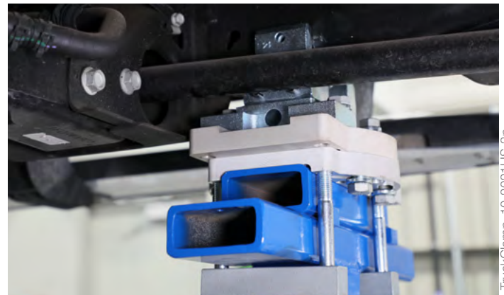
Clamps easily adapt to hard to reach areas and obstructions