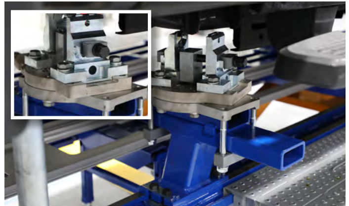
Clamps rotate to accommodate new angled frame designs