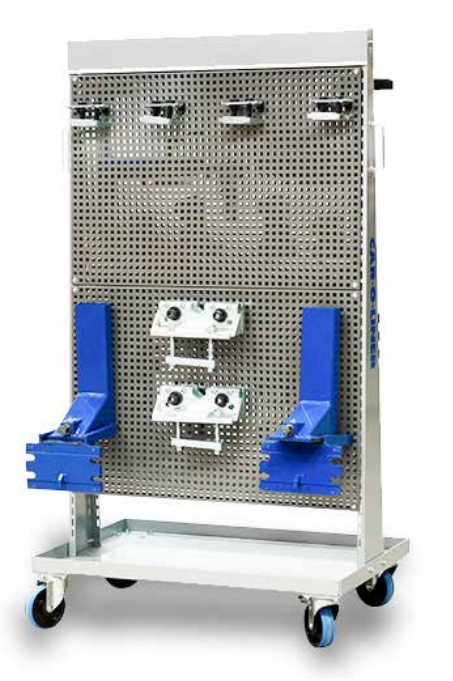
WAGONS/TROLLEYS ON WHEELS CAN EASILY BE MOVED TO WHERE THEY ARE MOST NEEDED

TOOL BOARDS WITH SILHOUETTES HELP YOU TO ORGANIZE YOUR TOOLS